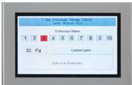
Large touchscreen for endoscope cycles at a glance