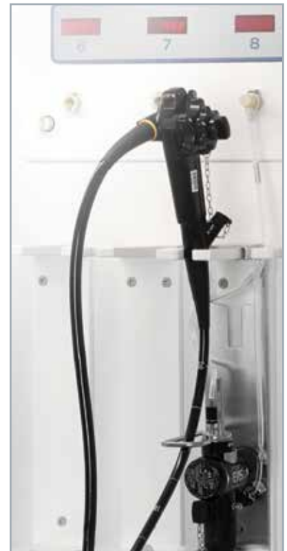
Ease of endoscope placement and one-click cabinet connection