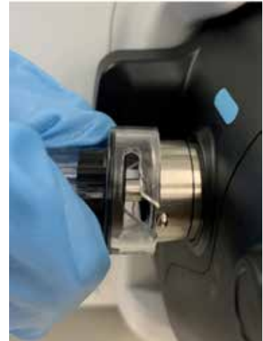
Align pins to grooves.

As stated in the IFU, care should be taken to properly align the pins on the side of the endoscope port to the grooves of the ENDO SMARTCAP Tubeing Connector. When in-servicing customers, highlighting the need to properly align the pins in the grooves is important to prevent damage to the connector, which could lead to visible debris occurring on the outside of the endoscope connection.